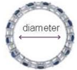
MATCH THE INSIDE EDGE OF THE RING

Each Angara ring comes with the option of one free resizing during the first year of ownership. Simply call Angara's Personal Jewelers at 888 926 4272 to arrange for your free resizing.